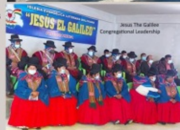
Jesus The Galilee Congregational Leadership