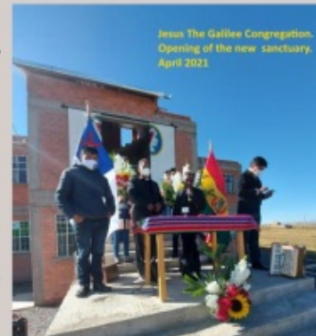
Jesus The Galilee Congregation. Opening of the new sanctuary. April 2021

Evangelical Lutheran Church in America God's work. Our hands.