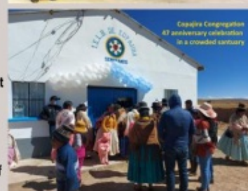
Copacopa Congregation 47 anniversary celebration in a crowded sanctuary