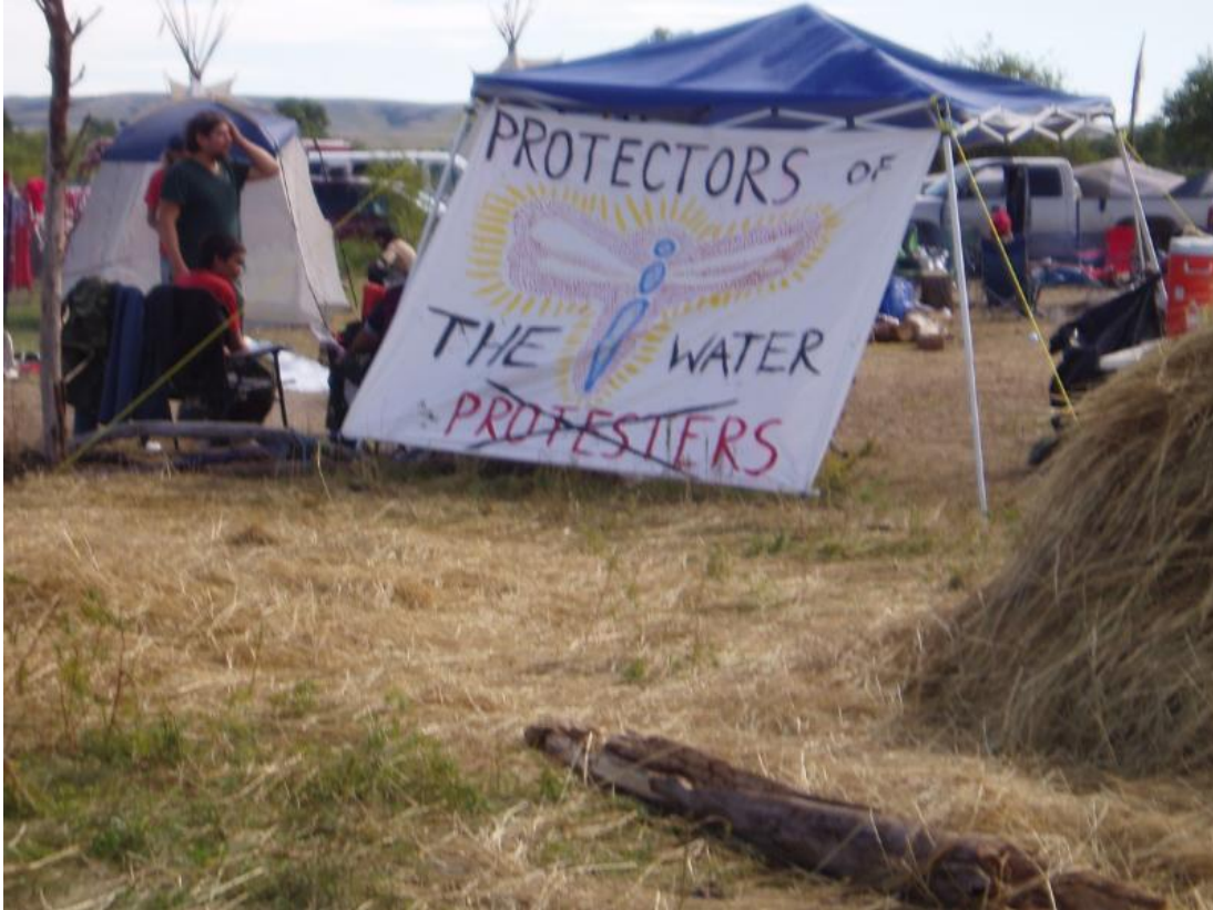
Standing Rock

On October 24-25 I will be at Standing Rock, in solidarity with the tribes. I will be there because our Synod's Apology pledged us to stand with the tribes, and I will be there because the Repudiation of the Doctrine of Discovery did the same. You can find an interfaith statement signed by the ELCA on our web page. Below is a presentation I did for the Conference of Bishops on St. Francis Day, last week.