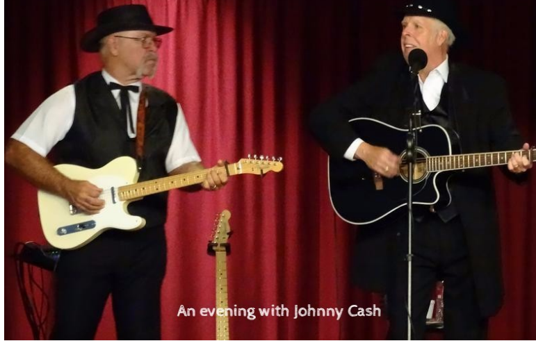
An evening with Johnny Cash