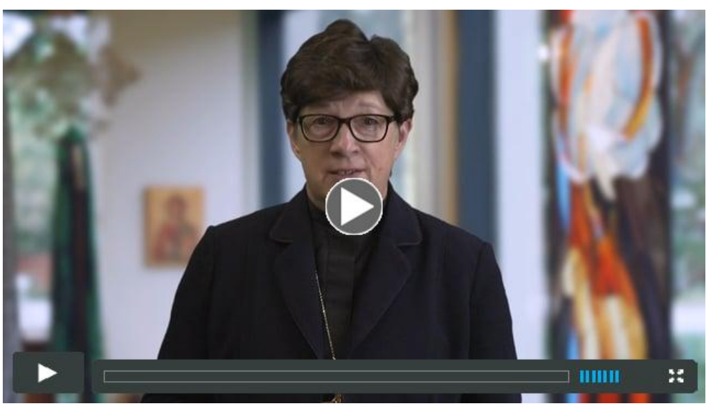
Grace Gathering Invitation

Learn more and register at www.ELCA.org/GraceGathering