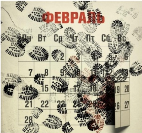
Fevral (February).

As I am writing this, it is one year ago to the day that our family landed in Istanbul.