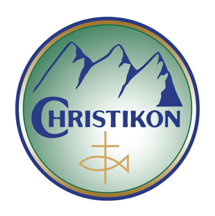
November 2023 Information for our Congregations

Our summer calendar is set and on our website (christikon.org). If you have questions about the 2024 season or would like to register, give us a call or do so online. It was a powerful summer of ministry this year, and we look forward to welcoming you to camp in the new year.