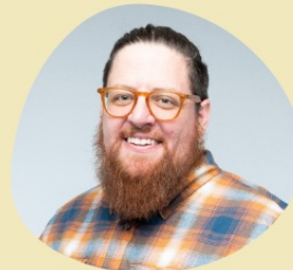
Kinnon Falk Kindred Kitchen